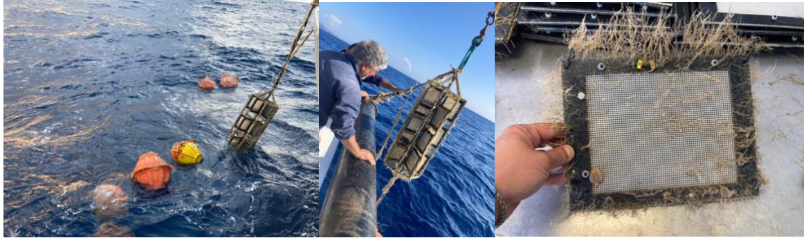
Figure 2: Retrieval of the steel frame with mounted samples at Sicily Channel (SICO) in October 2022, and documentation of fouling. All pictures are representative for the deployment at the Corsica Channel (CoM).