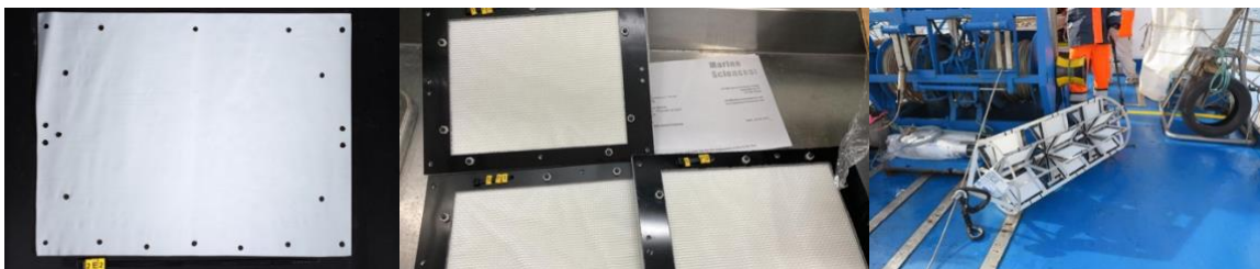
Figure 1: PHB film sample prior and post assembling in protection frames and mesh. Mounted onto steel frame ready for deployment at Sicily channel (SICO). All pictures are representative for the deployment at the Corsica Channel (CoM).

These outcomes demonstrate the successful development and testing of the custom-built frames, as well as the planned deployment and retrieval process, which will contribute to the accurate measurement and analysis of material degradation in marine deep-sea environments.