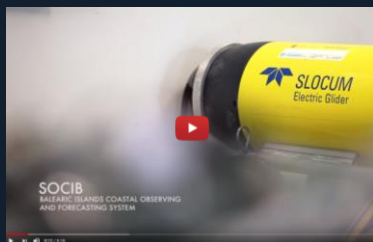
Videos about glider mission, glider animations...