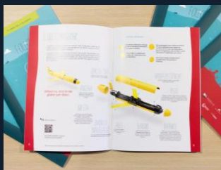
2 languages: English and Spanish