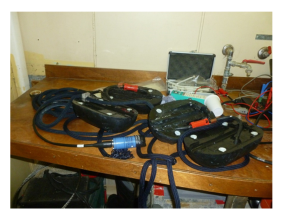
Fig. 2: Photo of the two SQUID and optode. The Squid is made of 2 parts, one with the battery and one with the data logger on which the oxygen optode is connected.

applying the Uchida algorithm (Uchida et al. 2008). This is part of the metadata accompanying the sensor, but the embedded calibration coefficients have not been altered. Data correction will be done post deployment to check for drift and quality control.