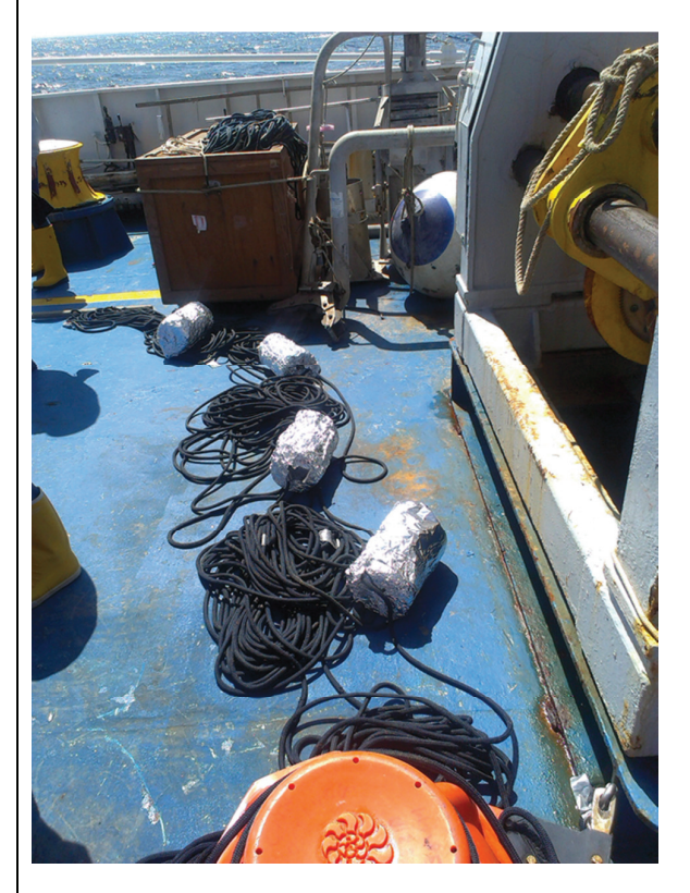
Figure 3 Deployment of passive sampler cages on the MPLS.

This first attempt of using passive sampler cages in Mediterranean sea deep-water highlighted some technical problem with regard to the currently available materials for marine deployment. Based on what we learn from this experience we designed a totally new cage completely built in Titanium and deployed during a second campaign in autumn . A new set of two titanium cages with 3silicon rubber sheet each, is currently attached on the MPLS mooring and will be collected in April 2015.