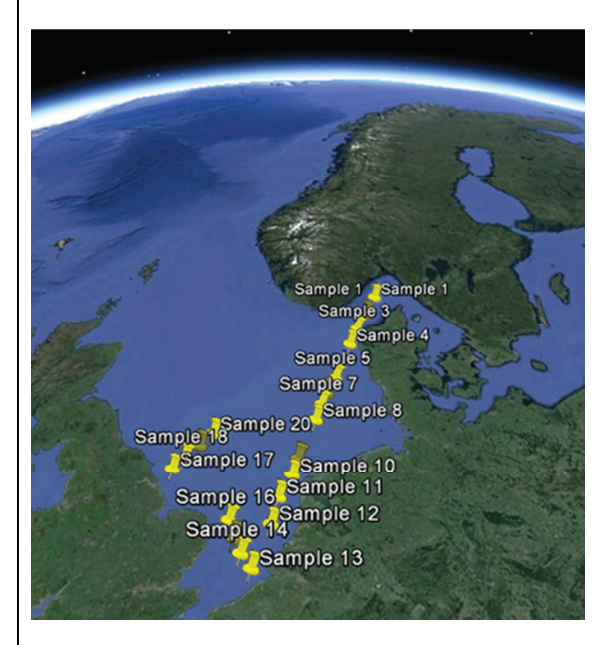
Figure 1. Sampling location. Activity 1

water samples from the Lysbris (Ferry box) in the North sea surface water. We collected in total 48 sample that were aggregated 4x4 based on geographic area(to achieve volumes sufficient for detecting trace chemicals in water). Figure 1 reports the location of the sampling.