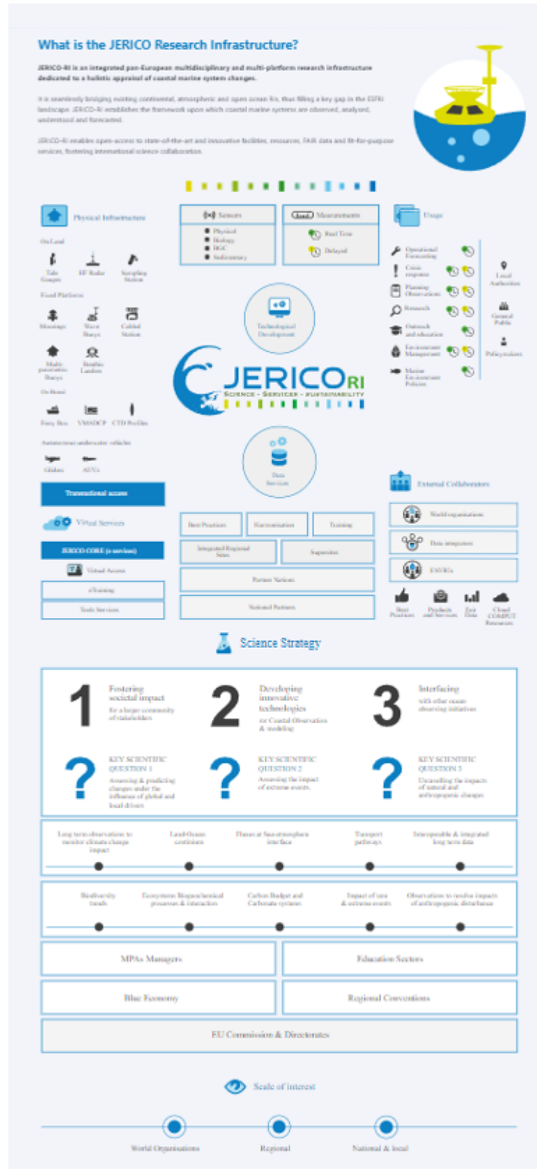
Figure 2: Infographic of the JERICO-RI