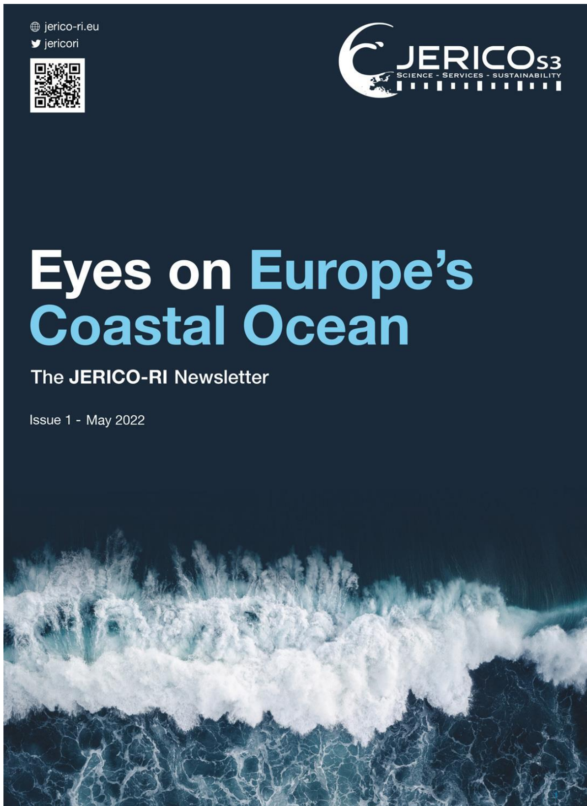
Figure 4. First JERICO-RI newsletter cover.