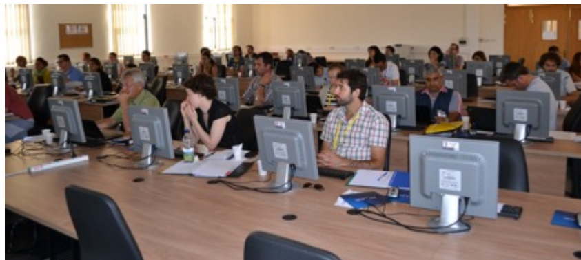
Computer lab during Malta Summer School 2013

A number of hands-on sessions will be delivered in a computer lab equipped with audio-visual facilities. Each participant will be provided with a workstation on which all software required will be installed. A University of Malta computer account will also be provided for Wi-Fi connectivity throughout the campus and residence.