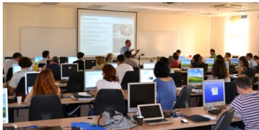
Computer lab during Malta Summer School 2013