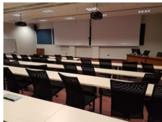
Lecture Capture facility to be used during JERICO-NEXT Malta Summer School 2018